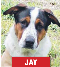
JAY MIXED BREED

Social and good-natured, Ted is a big softie but with enough presence to keep your home safe. He's unlikely to be found lying on the couch all day dreaming about his next manicure. This guy wants to get out there – running, playing and enjoying some company.