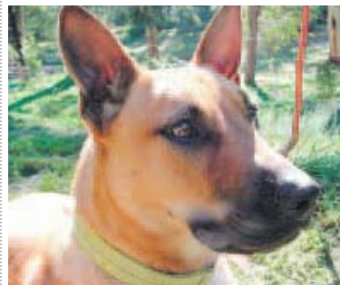
▲ Kiki, ID 47174

Max is a bit of a character who loves attention and cuddles. The greyhound gets on well with other dogs, but would prefer a home where he was the star.