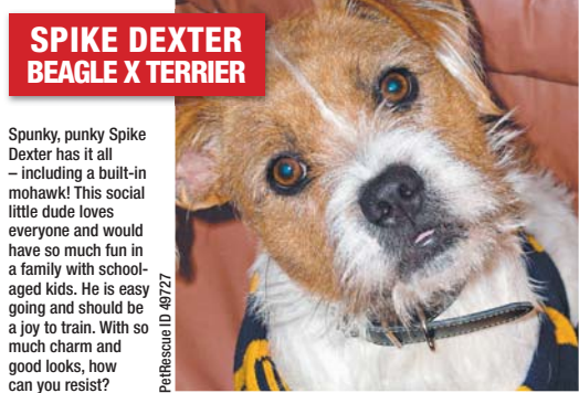
SPIKE DEXTER BEAGLE X TERRIER

PetRescue is a not-for-profit organisation that finds permanent homes for unwanted pets. They are Australia's only national, searchable, on-line directory of rescued animals, and have saved over 34,000 animals since August 2004. Bringing together over 450 rescue groups, they collaborate on projects in the community that increase the profile of rescue pets. PetRescue receives over 250,000 visitors to their website – www.petrescue.com.au – every month, and produce an educational and informative e-newsletter which is distributed to over 30,000 people. They feel privileged to be able to give these great pets a second chance by acting as 'matchmaker' between them and their new families.