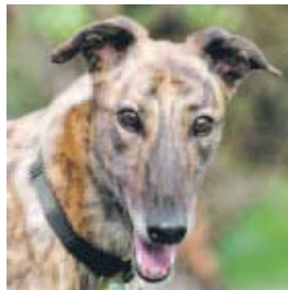
▲ Max, ID 48248

Max is a bit of a character who loves attention and cuddles. The greyhound gets on well with other dogs, but would prefer a home where he was the star.