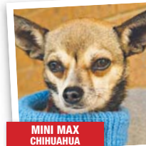
MINI MAX CHIHUAHUA

This handsome young pup is looking for cuddles and a warm home that will nurture him. Storm has the beautiful Border Collie temperament and will make a fantastic family member.