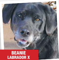
BEANIE LABRADOR X