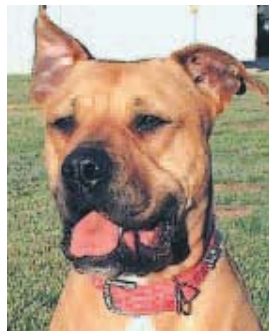
▲ Wilma, ID 49615

Tyson is an adorable pug who loves other dogs and people. He is best suited to a home with a patient owner who could give him some training and lots of love.