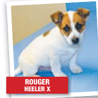
ROUGER HEELER X

Bellar loves to go for strolls and spending time on laps. She's ready to find a loving home and an owner committed to bathtimes and grooming to keep her looking her best!