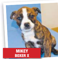
MIKEY BOXER X