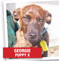
GEORGIE PUPPY X

ALI is an elegant young miss with a beautiful jet black coat and an endearing expression. She's an energetic girl with a big smile and would just love to be part of a loving family.