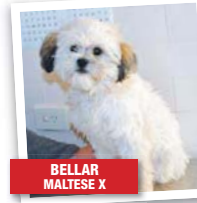
BELLAR MALTESE X

I am an easy going older lady with a friendly and happy nature. I may be 8-years-old but I'm full of life. I love to play and I like to show my joy by barking as I run around playing.