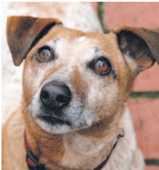
▲ Bomby, ID 47531

Bomby is a clever Jack Russell cross. He is looking for a home that can give him the exercise and mental stimulation such a smart dog needs. Bomby loves a good run and enjoys a tummy rub. He would most suit being the only dog in the home.