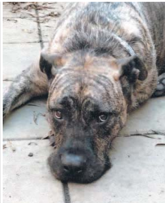
▲ Holly, ID 49793

Maddie is a sweet, intelligent and friendly kelpie who loves to play. She is about six months old and already knows some basic commands. She would love a home with another dog.