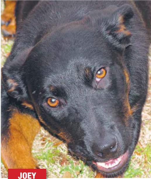
JOEY KELPIE X