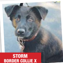
STORM BORDER COLLIE X

This puppy is the perfect little gentleman. He is house-trained and social. Good with people and other dogs his calm, gentle nature makes Terrence the ideal canine companion.