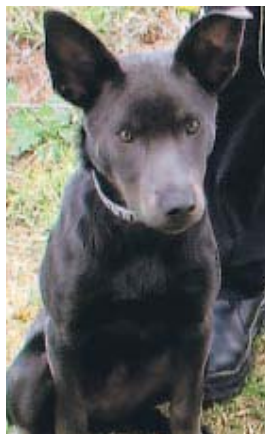
▲ Maddie, ID 45523

Bomby is a clever Jack Russell cross. He is looking for a home that can give him the exercise and mental stimulation such a smart dog needs. Bomby loves a good run and enjoys a tummy rub. He would most suit being the only dog in the home.