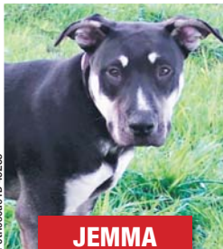
JEMMA MIXED BREED

Kuta is a handsome older gentleman with so much to offer. He is fit and lively, enjoys a good game and playing with his toys. No mess to worry about, this dapper boy is house-trained and just adores people. If you've been searching for a beautiful companion, look no further!