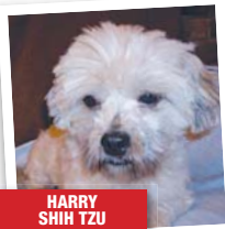
HARRY SHIH TZU

Beanie would love to be a part of your life. He has a great heart and is a great companion dog who walks well on the lead and is excellent in the car. A very good boy indeed!