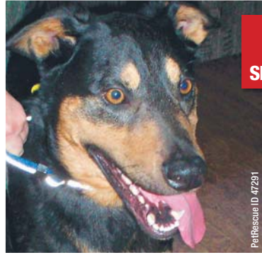
ELI GERMAN SHEPHERD X

What a sweetie! If you've had a hard day it will soon be forgotten when Jay welcomes you home. He has started his training and can already sit – and he is looking forward to learning more! Jay will be a lovely companion and loyal family member if you welcome him into your heart.