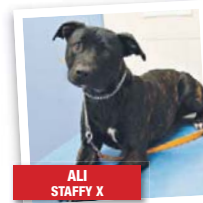
ALI STAFFY X

MIKEY is a sweet 7-week-old puppy, waiting for a brand new forever home where he'll be lavished with love and affection. This adorable boy would simply love to be part of your family.