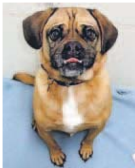
▲ Tyson, ID 49605

■ Here's your chance to provide a new home for unwanted pets with the help of Pedigree and PetRescue, a not-for-profit organisation that brings together more than 450 rescue groups. PetRescue is Australia's only national, searchable, online directory of rescued animals and has saved more than 34,000 animals since 2004. For more details on any of these dogs, go to www.petrescue.com.au and enter the dog ID number.