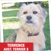
TERRENCE AUST. TERRIER X

Maximus is the ultimate family dog. He loves going for walks, is loyal and is very intelligent. Make this good looking fella a part of your family today and you'll certainly have no regrets.