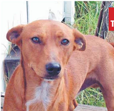
SAMMY TERRIER X

Joey may not leap straight into your arms, but this gentle 8-month-old boy will win your heart. He is house-trained, intelligent and just lights up around kids. Joey loves to play and cuddle, but equally enjoys a quiet snooze and doesn't constantly demand attention. What a beautiful boy.