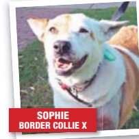
SOPHIE BORDER COLLIE X

I am a cute girl looking for a loving home. I'm going to need a family with the time and enthusiasm for regular play and patient training to help me become a well adjusted adult.