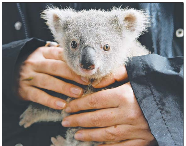
Star attraction: All this baby koala at Wildlife World needs is a name

Another $517,000 bill was lodged by MPs for "other car costs", including bills for travel paid for by their portfolio departments.