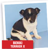
BEKKI TERRIER X