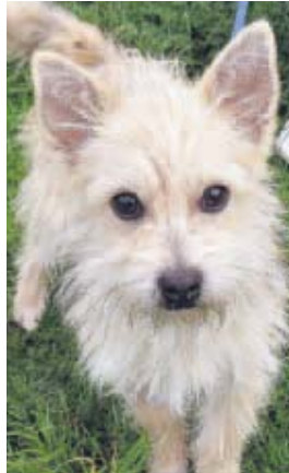
▲ Pip, ID 48139

Theo is a young heeler cross who would make a fabulous companion dog. He has beautifully coloured soft fur and is quiet by nature rather than boisterous. He listens to what you say and is alert, intelligent and interested in everything.