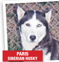
PARIS SIBERIAN HUSKY

It will be love at first sight with the sweet natured Lexi. With her gentle demeanor and a very easy-care coat she will make an excellent family pet. Have you got space for Lexi?