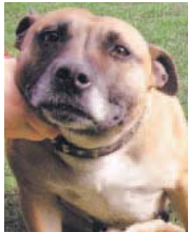
▲ Tess, ID 48146

Riley is a sensitive soul. He can be shy at first and is a little scared of cats and big dogs. But once he has time to get to know you, he turns into a typical Jack Russell, fun loving, energetic and playful.