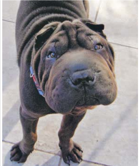
▲ Dexter, ID 48408

Pip is a quiet and loving terrier cross who is only one year old. He has basic obedience training and is looking for a loving home where he can grow up to be a companion for life.