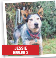
JESSIE HEELER X

Speedy is an adorable, bouncy young munchkin who is easy to fall in love with. He has a playful personality, a great sense of fun, and loves the company of people, dogs ... and even cats.