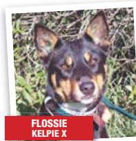
FLOSSIE KELPIE X

Bekki is an adorable puppy with the cutest black and white coat. She is extremely friendly, loves her food, playing with toys and generally lapping up attention. Can you give her a home?