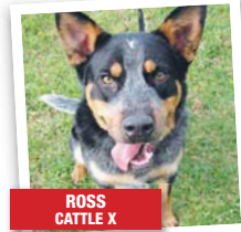
ROSS CATTLE X

Snoopy is a doggy gem! He loves to play fetch, sits for his food and doesn't jump up. Boofy with a big personality, he would love to be re-homed with another doggie friend.