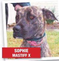
SOPHIE MASTIFF X

I am a smoochy girl who is a working dog at heart. I will make a lovely dog for a family with older children or someone who enjoys running, playing and exploring new places.