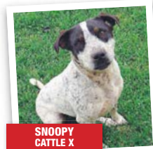
SNOOPY CATTLE X