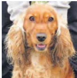
▲ Sam, ID 48127

Sam is a young, loving cocker spaniel boy looking for a warm home this winter. He is about two years old and has basic obedience training.