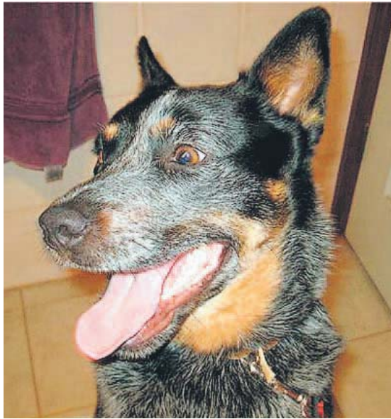
▲ Theo, ID 48113

Theo is a young heeler cross who would make a fabulous companion dog. He has beautifully coloured soft fur and is quiet by nature rather than boisterous. He listens to what you say and is alert, intelligent and interested in everything.