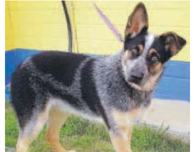
◀ Willie, ID 48453

Sumatra is an eight-month-old heeler-German shepherd cross with a luxurious coat and a love of people. She is gentle-natured and great with dogs, cats and horses. She is very affectionate and likes children. She will need to be taught not to jump up as she loves to cuddle everyone she meets.