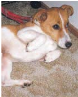
▲ Riley, ID 46924

■ Here's your chance to provide a new home for unwanted pets with the help of Pedigree and PetRescue, a not-for-profit organisation that brings together more than 450 rescue groups. PetRescue is Australia's only national, searchable, online directory of rescued animals and has saved more than 34,000 animals since 2004. For more details on any of these dogs, go to www.petrescue.com.au and enter the dog's ID number.