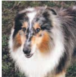
▲ Finn, ID 48658

Finn is a handsome collie rough who loves a cuddle. He is an energetic dog, so a good-sized yard is preferable and he needs to go on daily walks.