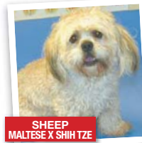
SHEEP MALTESE X SHIH TZE

I am a sweet and smoochy young lady with a happy friendly nature. I will make a lovely dog for an active family that will make me part of their lives and give me lots of exercise.