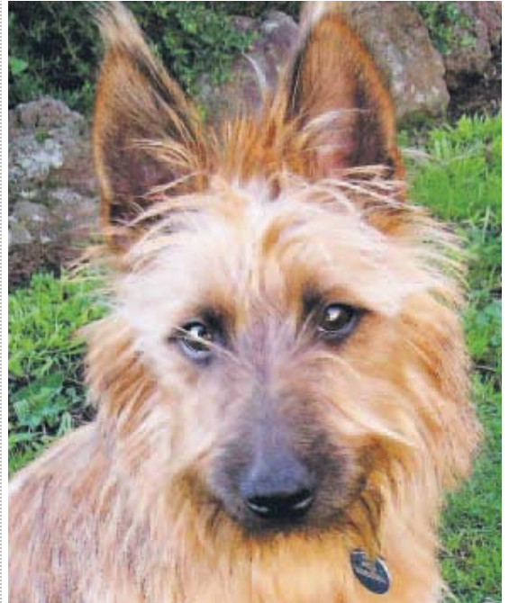
▲ Katey, ID 45517

Harry the greyhound is a lovely, bouncy dog who enjoys running and playing. Harry gets a little startled by sudden noises, but would make a great companion to a younger owner without cats.