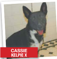
CASSIE KELPIE X

I'm just 9 weeks old but ready for my first ever home. I'm cute as a button and will grow up to be a beautiful girl full of love for the right family.