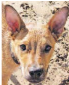
▲ Jack, ID 30910

Nemo is an energetic, intelligent, affectionate seven-month-old collie cross with the most stunning eyes. With training he'd make a wonderful pet, but needs exercise and company.