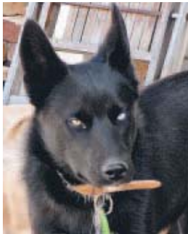
▲ Nemo, ID 46281

■ Here's your chance to provide a new home for unwanted pets with the help of Pedigree and PetRescue, a not-for-profit organisation that brings together more than 450 rescue groups. PetRescue is Australia's only national, searchable, online directory of rescued animals and has saved more than 34,000 animals since 2004. For more details on any of these dogs, go to www.petrescue.com.au and enter the dog ID number.