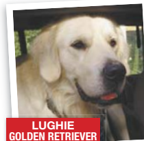
LUGHIE GOLDEN RETRIEVER

Ruby is an 8 month-old girl who would love to belong to someone with an active lifestyle. She is a beautiful dog who will make a loyal and devoted companion.