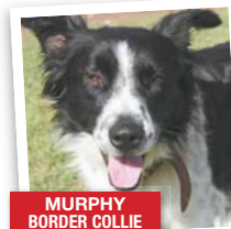
MURPHY BORDER COLLIE

Sarina is a happy, friendly girl who is great with other dogs and people. She is highly affectionate and would be a lovely addition to any home.