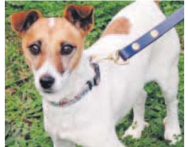
◀ JJ, ID 48922

Rita is a very energetic little dog who loves to play fetch. She needs a loving family, a nice yard to run around in and a comfortable bed indoors to retire to when the fetching is done.