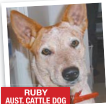
RUBY AUST. CATTLE DOG

This 18 month-old gentle giant is a lovely, sweet-natured girl. She enjoys the company of other dogs and can be quite playful. Make Sully a part of your family today.