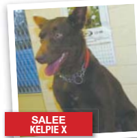
SALEE KELPIE X

Jordan is a typical Jack Russell – an adorable and bouncy young boy who is easy to fall in love with. He has a playful personality, a great sense of fun, and loves company.