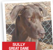
SULLY GREAT DANE

Murphy is a great boy. His social nature means that he is wonderful with both dogs and children. Make this beautiful purebred the latest member of your family.