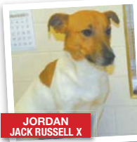
JORDAN JACK RUSSELL X

Sheep is a young Maltese cross with beautiful fluffy curls that make him look just like a sheep! This adorable lamb is looking for a family who can spoil him and he'll repay you with love.