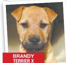
BRANDY TERRIER X