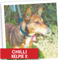
CHILLI KELPIE X