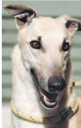
▲ Harry, ID 48590

Harry is a happy, loving stumpy-tailed red heeler puppy with a gentle, playful nature. He gets along with other dogs well and is not bothered by cats. He loves a sleep by the heater, going for a walk and playing with other dogs.