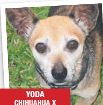
YODA CHIHUAHUA X

Kye is just a bub. He has handsome good looks and is presently learning doggy manners. He would love a family that supports his continued learning by taking him to training.