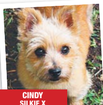
CINDY SILKIE X