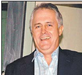
Rich list: Malcolm Turnbull

I hope Samson And Delilah can help change that.