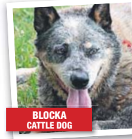
BLOCKA CATTLE DOG