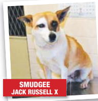
SMUDGE JACK RUSSELL X

If you are looking for a dog to share a walk, potter about with you at home and lie at your feet in the evening, then Blocka is your boy. A mature gentleman, he is the perfect companion.