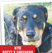
KYE ROTTY X SHEPHERD

Ricky is a gorgeous boy that needs a strong and positive leader to show him how to be a great companion. He walks well on lead, needs daily exercise and loves attention.