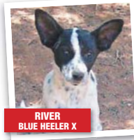
RIVER BLUE HEELER X

Coco is a lovely gentle older girl who is in good health. She is good with other dogs, knows basic obedience and is looking for a retirement home where someone will love her.