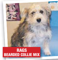
RAGS BEARDED COLLIE MIX