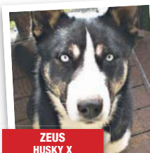
ZEUS HUSKY X

Manny's a beautiful boy, who is looking for his forever home! He's very friendly, incredibly affectionate and has good social skills. Do you have room in your heart for Manny?