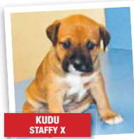
KUDU STAFFY X