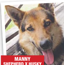
MANNY SHEPHERD X HUSKY

Yoda is a bit like his name sake, a little wizened but with a gorgeous soul. He loves his canine friends and he's totally loyal, so you'll find him at your heels watching everything you do.