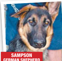
SAMPSON GERMAN SHEPHERD

Toby is a mature-aged gent who has found himself homeless. He's still active, cheerful and outgoing and absolutely LOVES going for walks. Toby gets on well with everyone.