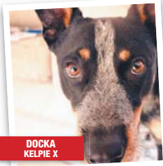
DOCKA KELPIE X

PetRescue receives over 250,000 visitors to their website - www.petrescue.com.au - every month, and produce an educational and informative e-newsletter which is distributed to over 30,000 people. They feel privileged to be able to give these great pets a second chance by acting as 'matchmaker' between them and their new families.