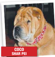
COCO SHAR PEI