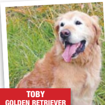
TOBY GOLDEN RETRIEVER

Lulu is a special senior who's been a loved house dog, goes to her bed when asked and doesn't bark. She's friendly and may not be cute and fluffy but has lots of love to give.