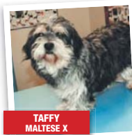
TAFFY MALTESE X

Picture me lying on your bed or keeping your feet warm while you watch TV. I'm 8 now and ready for the good life. But I'm not retired yet. I love my daily walk and to run around.