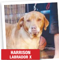
HARRISON LABRADOR X

I'm a Red Cloud Kelpie, a stunning girl, with a personality to match. I need plenty of stuff to keep me busy. With the right person I'll be all a Kelpie can be - loyal, friendly and a best mate.