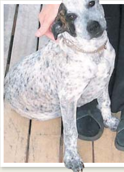
MISSY Cattle dog mix

Missy is a bundle of fun and energy. You'll always feel loved with Missy's excited greetings. Missy is ready to learn; she is smart and vibrant and would be great to take to dog school. Don't be fooled, Missy has a gentle side, too. She loves a cuddle and after a busy day will be content to lie at your feet in the evenings. PetRescue ID 46370