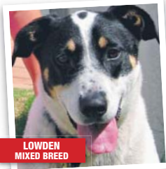
LOWDEN MIXED BREED

Who could resist that face? Docka is a sweet young boy who loves being inside and sleeping on his bed. He appears to be house trained and good with other dogs. He would love a home where he could spend time with you and become your new best friend.