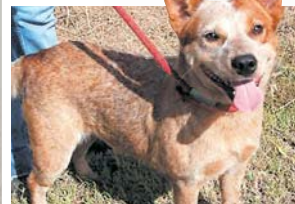
KOKO Red cattle dog

Koko is all you could want in a "city" cattle dog: fit, young, healthy and able to keep up with you on your morning jog. Then she will happily lie at your feet while you work. She is great with older kids (too boisterous for the littlies), intelligent and loving. If you're looking for a best mate, you have found it in Koko. PetRescue ID 45850