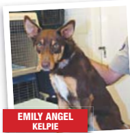
EMILY ANGEL KELPIE

If you think wrinkles are beautiful, then I'm your girl. After the shock of finding myself homeless at 8-years-old I'm now looking for a retirement home where someone will love me.