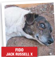
FIDO JACK RUSSELL X

I'm just weeks old and ready for my first ever home. I'm cute as a button and will grow to be a big boy full of love. All the effort that you put in now will make me a wonderful companion.