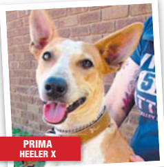
PRIMA HEELER X

Check out that smile! Latte is an affectionate, adorable little girl waiting for the right lap to sit on. If you're a fan of small dogs then this delightful little package might just be what you're looking for!