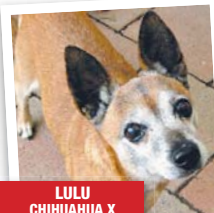
LULU CHIHUAHUA X

Billy is an obedient foxy who wants a family of his own who will care for him. He is well socialised, good with people and with other dogs. Do you have room in your heart for Billy?