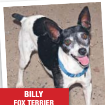
BILLY FOX TERRIER

What a stunner! This gorgeous boy is looking for an active and loving family to adopt him and look after him. Can you provide the charming Charm his forever home?