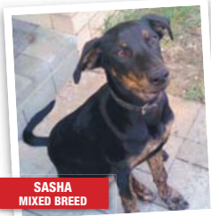
SASHA MIXED BREED

Lowden adores kids and is happy to be climbed over! He is a gorgeous-natured boy and the biggest sook you could ever meet. Lowden is well trained and would dearly love a home where he could be with you and show how much he loves and appreciates his new forever family.