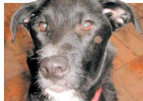
NITRO Wolfhound X

What's not to love about a whiskery face? Nitro is a wolfhound cross, possibly border collie, about 10 months old. Nitro is the best of both worlds. After an active day at the beach or running in the park, Nitro likes nothing better than to do his best imitation of a lap dog and curl up with you for a cuddle. PetRescue ID 46057