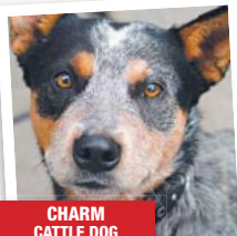
CHARM CATTLE DOG