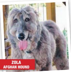
ZOLA AFGHAN HOUND

Prima is a wonderful puppy ready to bring some fun and adventure into your life. She loves her walks, fetching the ball, going to the beach and having a snooze. Water is a joy in her life and she loves a swim! She is friendly and easy to train. Is your family ready to welcome this gorgeous girl?